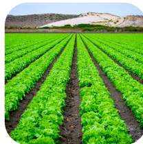
HORTICULTURE & AGRICULTURE