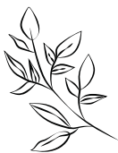
Protect & promote plant growth