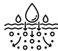
Encourages beneficial microbial soil activity