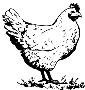
Improve poultry health & Yield